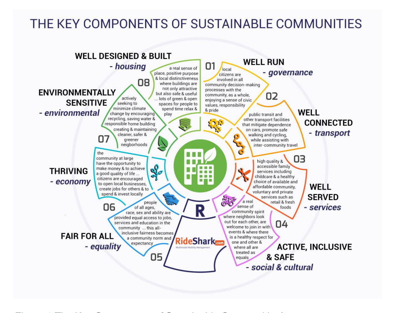
Figure 1 The Key Components of Sustainable Communities<sup>1</sup>

On the rural municipality authority level, it is important for us to set an example (including general values, green office as a method of implementing environmental policy (activities), green procurement, and environmentally friendly public events) and to involve people in talking about environmental issues and taking the action. Also, to pioneer in the adoption of large-scale energy projects - hydroelectric power and storage plant, wind farm, and hydrogen cooperation with neighboring municipalities and companies.